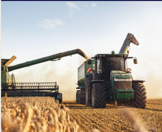
Agriculture, Aquaculture & Food