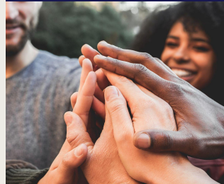
Society and Culture