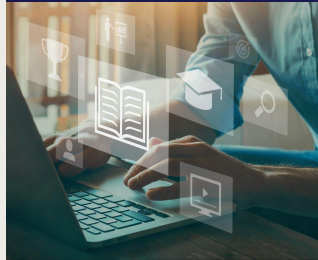
Research and Education